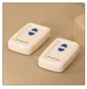
Two wireless remotes standard.