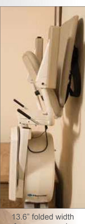
13.6" folded width for more room in your stairwell