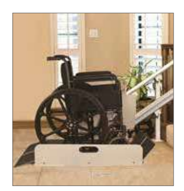
Incline Platform Lifts