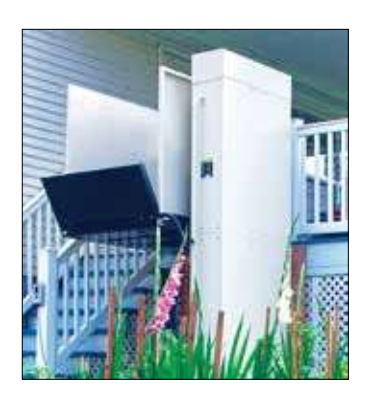
Vertical Platform Lifts