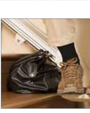
Safety sensors on chassis and footrest instantly stop the lift at any obstacle.