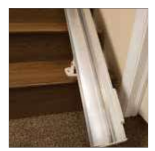
Covered gear rack keeps your stairs clean