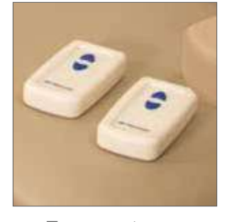
Two easy to use wireless remotes included