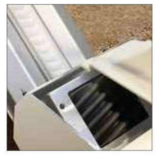
Patented helical worm gear, requires no messy greases to maintain a smooth ride.