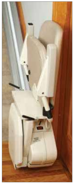
Narrowest lift on the market, fits in tight stairwells and makes it easy for others to pass.