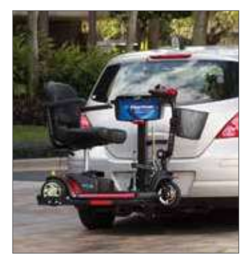
Multiple auto lift solutions for wheelchair or scooter