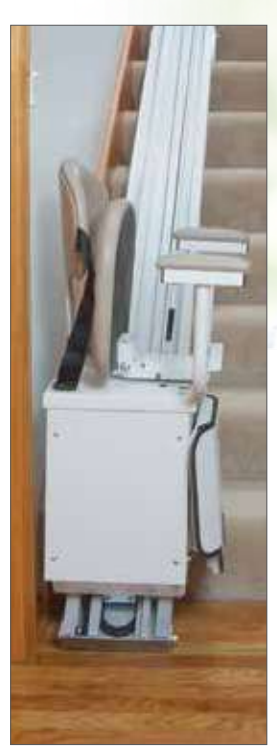
14" width when folded