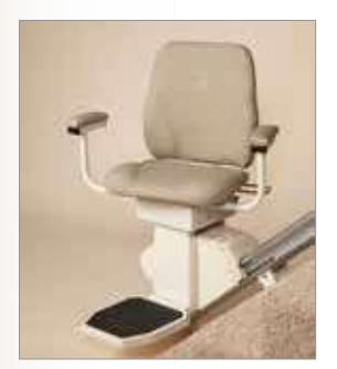
Pinnacle Heavy Duty