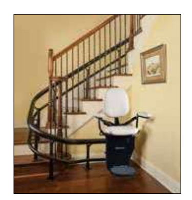
Curved Stair Lifts